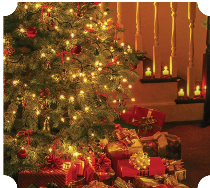
The holiday season is upon us, and that means scores of celebrants will be decking their halls. Though festive decorations are a part of the season, safety should always come first.

• Limit use of candles. Like Christmas trees, candles are a popular yet potentially hazardous decorative item during the holiday season. When decorating with candles, be sure that all candles are extinguished before leaving a room and never leave them burning when you go to bed. Candles should be kept away from any decorative items, including Christmas trees, that can