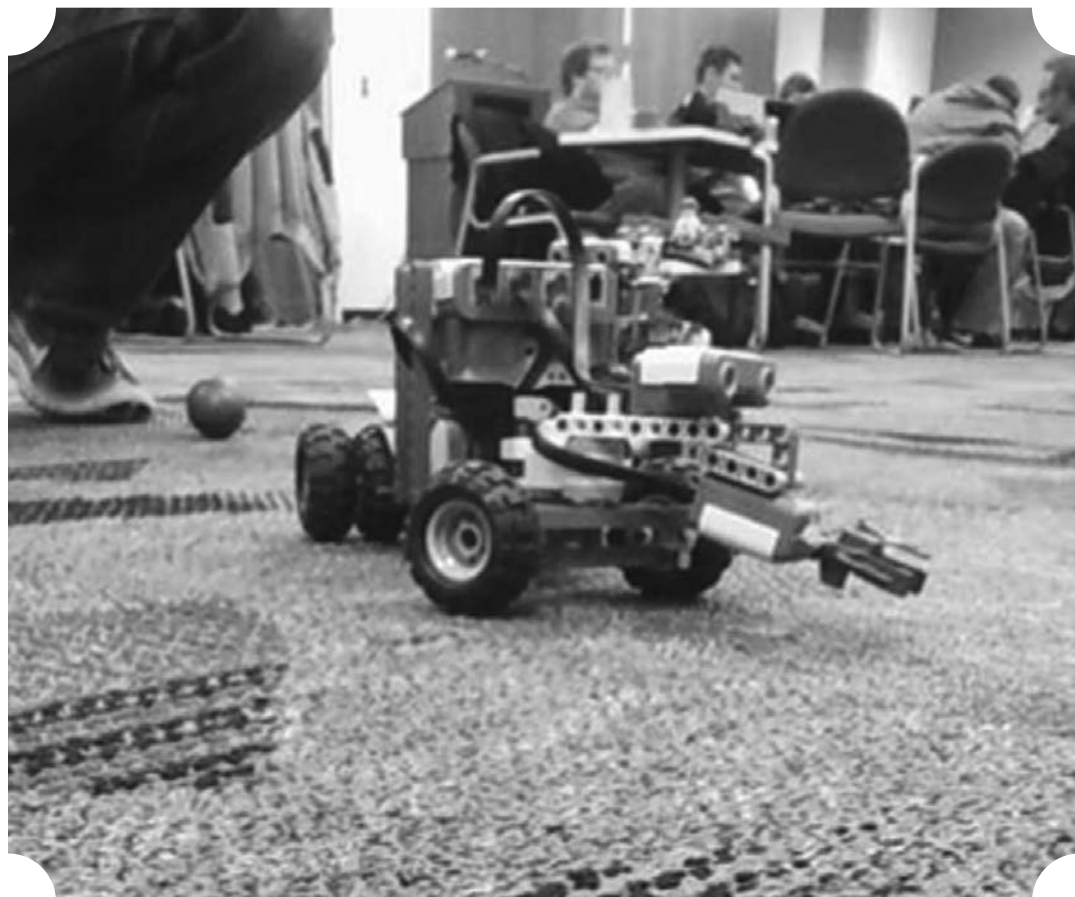
A Hack Day invention rolls across the floor during the HackSI event hosted earlier this month. This robot is made of Lego Mindstorms parts.