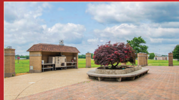
BEAUTIFUL OUTDOOR PATIO