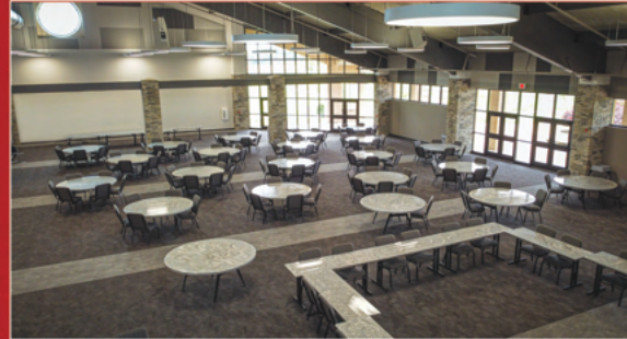
LARGE EVENT ROOM

With easy access, including plenty of parking, along with a serving kitchen, meeting room, AV Room, accessible bathrooms, family bathroom, and double foyers, the event center can host your event with ease.