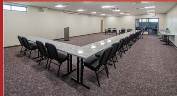
WARRIOR LOUNGE CONFERENCE ROOM