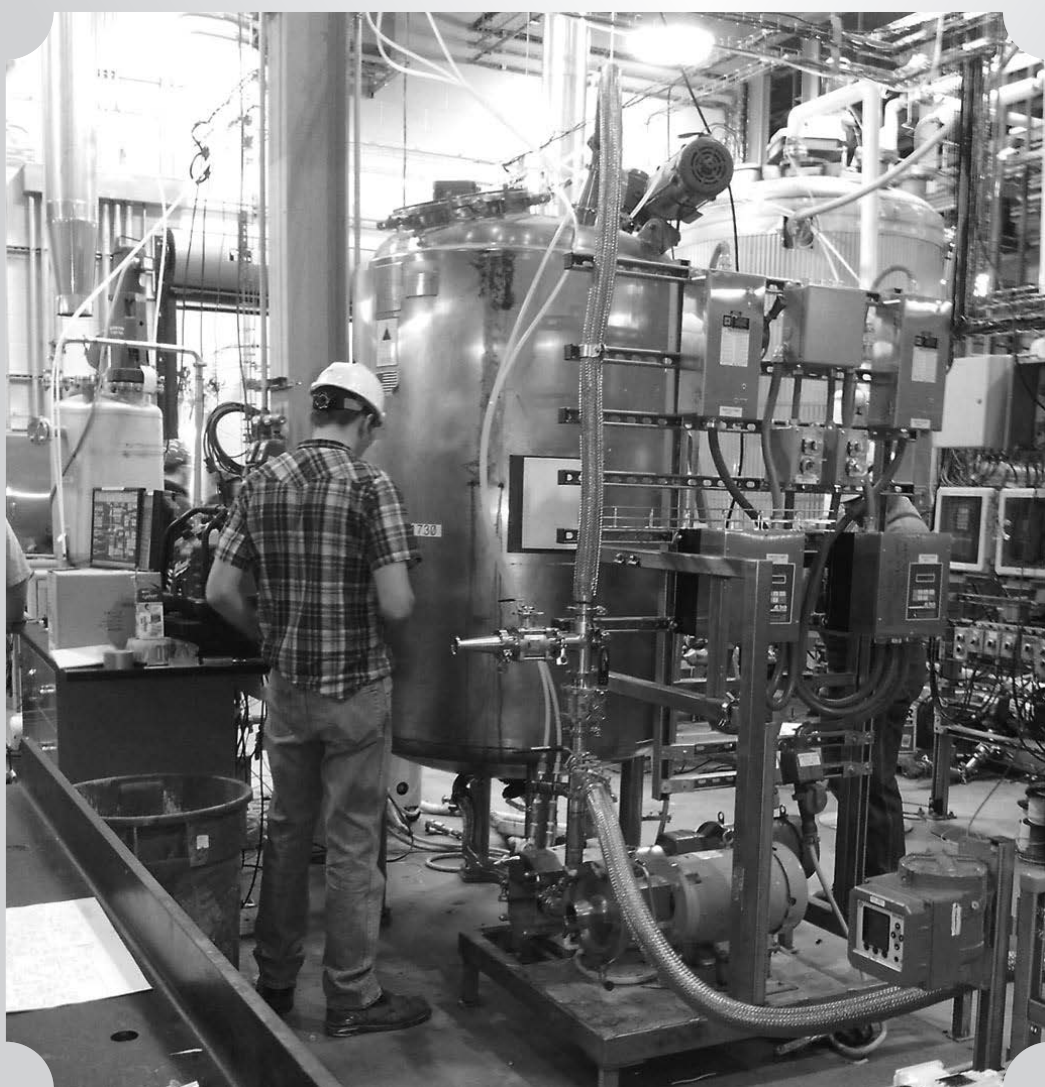
Personnel with the large fermenter at the National Corn to Ethanol Research Center at Southern Illinois University at Edwardsville.