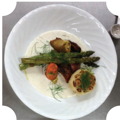
Traditional English Roast Beef

— For Rare: 12 to 15 minutes per pound and 125° to 130°F internal temperature