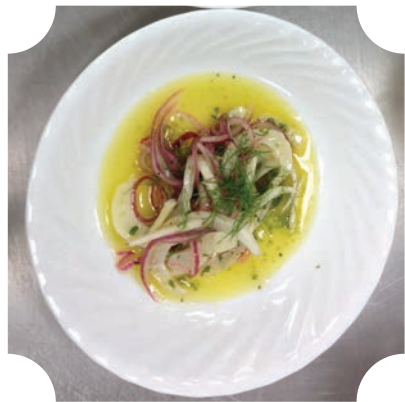
Fennel and Red Onion Salad

2. Drain, and transfer to a salad spinner. Spin until dry, and transfer to a serving bowl. Add lemon juice, oil, and celery seeds; toss to combine. Season with salt and pepper.