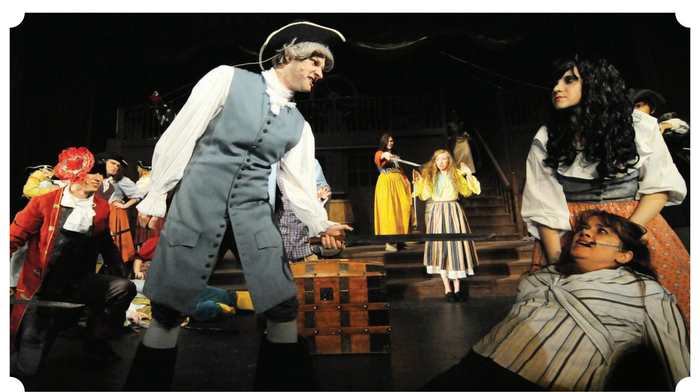
'Treasure Island' dress rehearsal