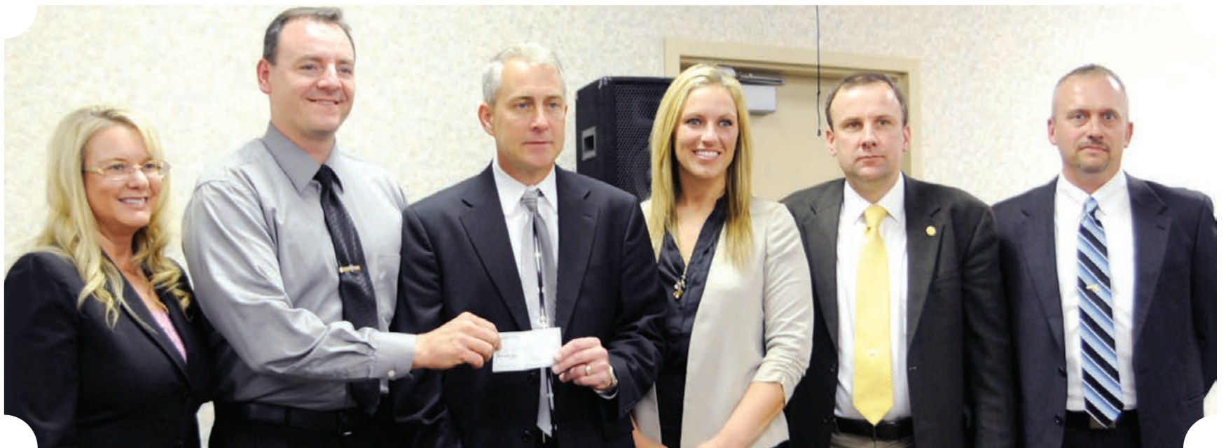
Representatives of Rend Lake College, Mt. Vernon Police Department and the RLC Foundation gathered together for a check presentation photo at the 2012 RLC Criminal Justice Roundup for Scholarships event. This year's Roundup is Oct. 29. Find event details online at www.rlc.edu/roundup or on the college's Facebook page at www.facebook.com/RendLakeCollege .