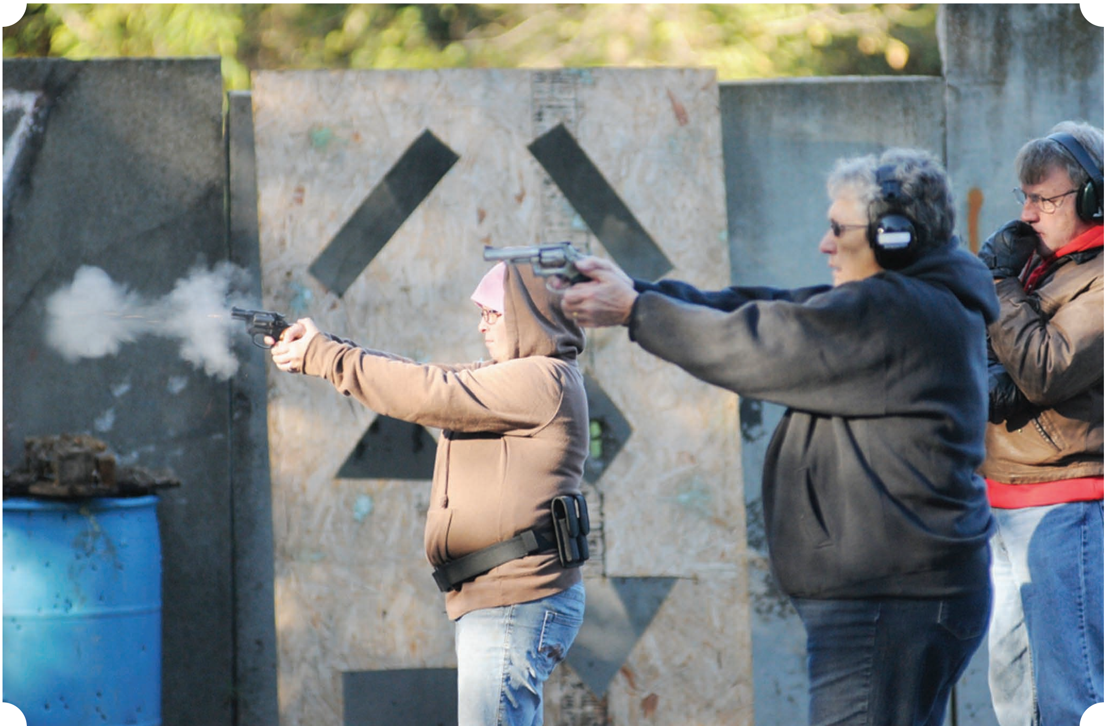
GET LICENSED — RLC students qualified on the range in Mt. Vernon last winter. The college will soon begin offering concealed carry certification classes for those wanting a license. The state starts issuing those licenses in January.