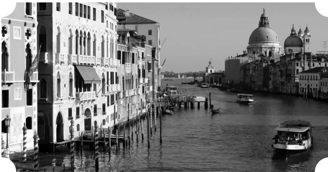
REFLECTIONS OF ITALY — Venice is a stop on the Reflections of Italy trip through RLC. An informational meeting for those interested is planned for 5:30 p.m. Oct. 1, at the Historic Schoolhouse on the RLC campus in Ina.

To register for these trips, contact the RLC Community and Corporate Education Division at (618) 437-5321, Ext. 1267, or visit online at www.rlc.edu/com-ed .