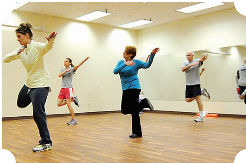
Rend Lake College is offering a slew of classes, like the one pictured above, at its new fitness center at the RLC MarketPlace in Mt. Vernon. The new facility also offers a ton of exercise equipment from which to choose. A five-month membership is only $53. Call 618-437-5321, Ext. 1348.

"We are going to continue to make improvements to the facility next year," he said. "We are looking at exploring putting in another bathroom, adding showers, changing rooms, maybe knocking out another wall and increasing the space we have." He added that, in the near future, a Zumba class will