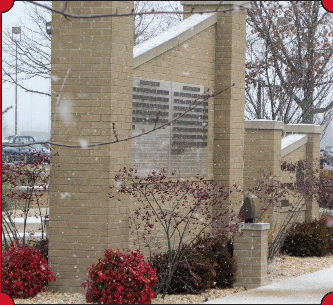
S now falls on the Rend Lake College Walls of Honor early last week. Forecasts call for temperatures to be above freezing and on the rise, with clear skies, through this weekend.