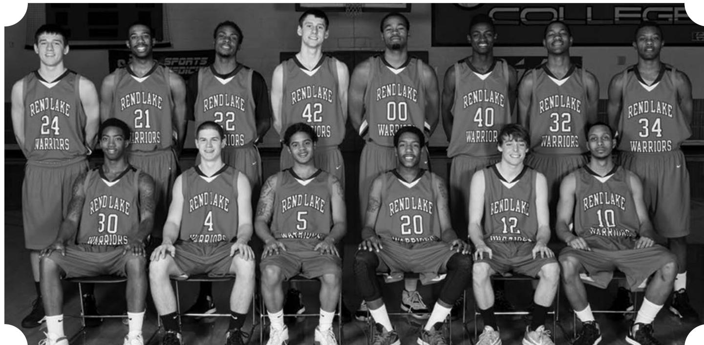
Rend Lake College 2012-2013 Men's Basketball Team

For all things athletic at The Lake, visit RLC online at www.rlc.edu/warriors .