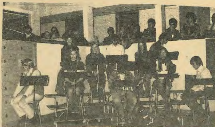
Reader's Theatre performs in Oasis

Rend Lake College features just about any activity that you as a future student could possibly want to join.