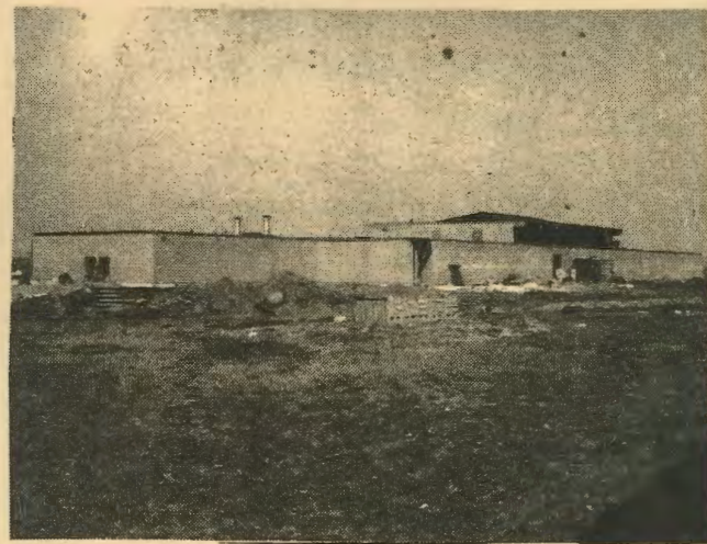
Future Vocational building at RLC

THE PRESSING TIMES March 4, 1973 Ina, Illinois