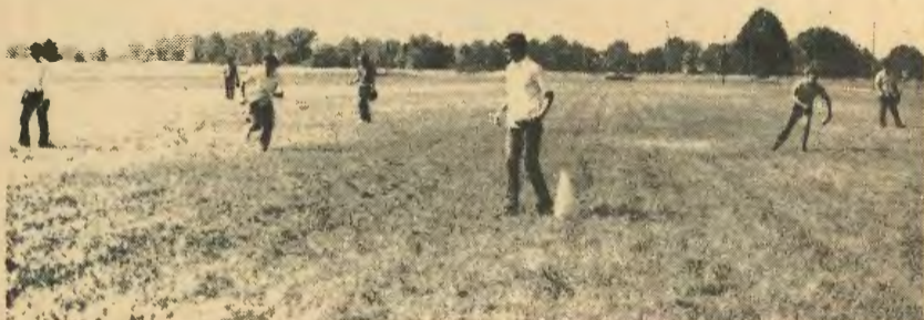
Slow pitch softball in action