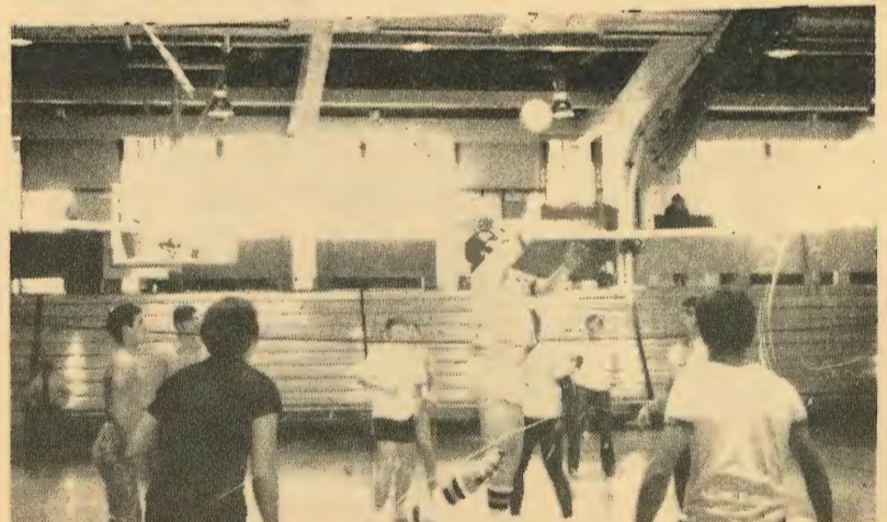
Intramural volleyball in action