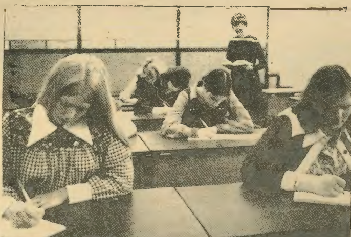
Secretarial training here at RLC