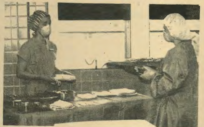
RLC's Operating Room Technique school