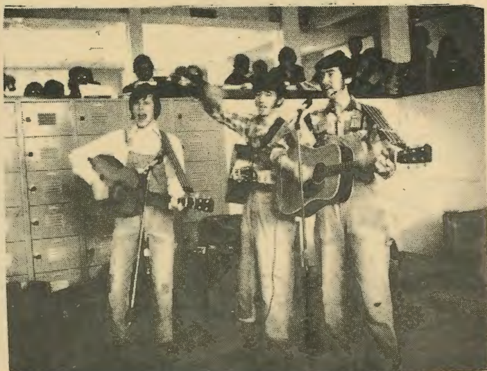
"Moonshiners" entertain students in Oasis