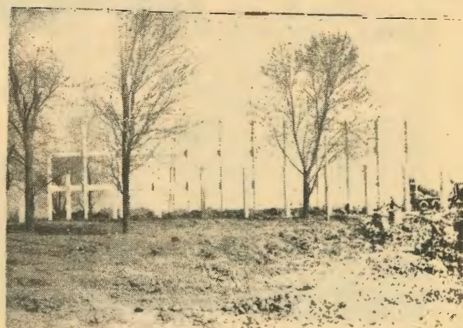
Learning Resource Center