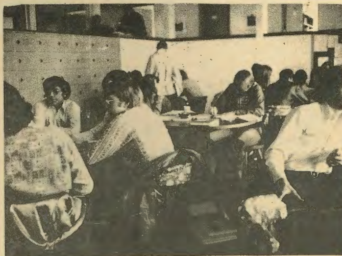
Oasis — gathering spot for students