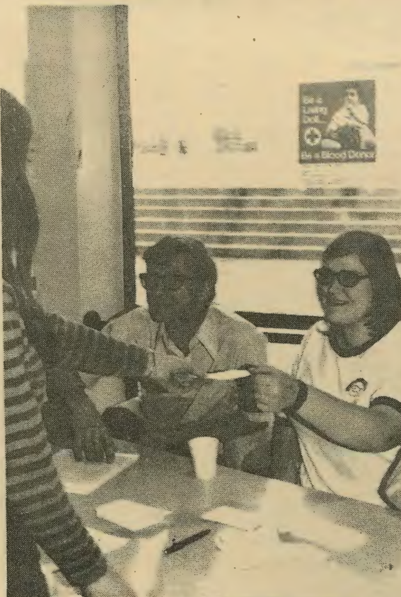
Couth Club register blood donor pledges

Veterans with any problems concerning education can join