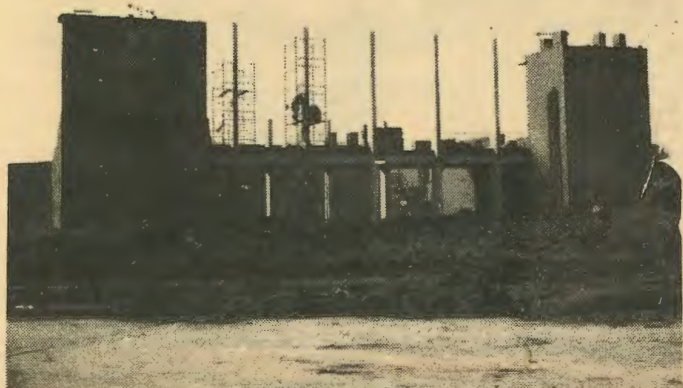
New Administration building at RLC