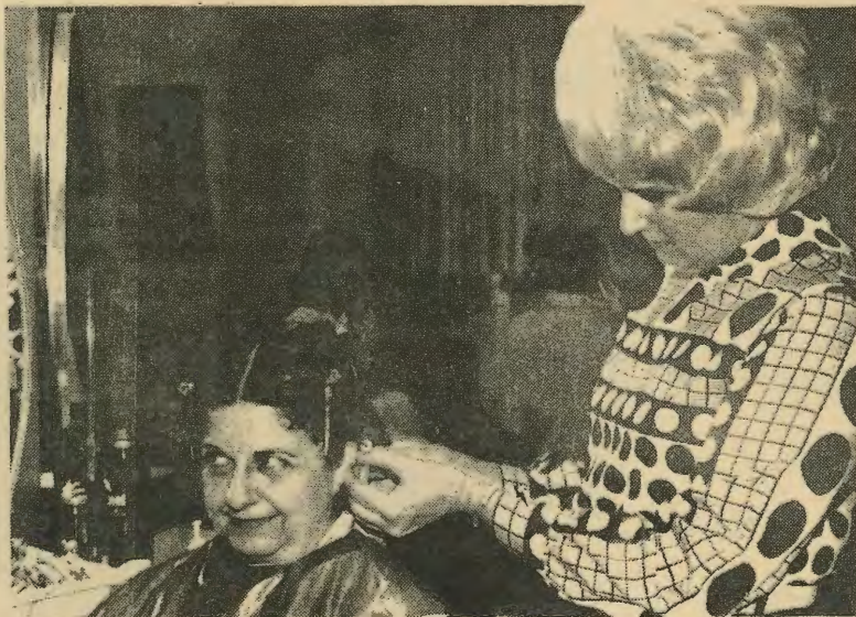
Cosmetology school in Benton