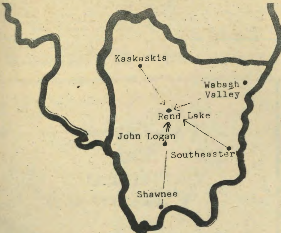
SECTION EIGHT, one of eight sections in the Region IV, is made up of six colleges in the Southern Illinois. Rend Lake College is the

But before all of this, there's about 50 games and two months of regular season baseball . . . and anyone who advances to Grand Junction, Colorado, will do so the hardway . . . because, it's the only way.