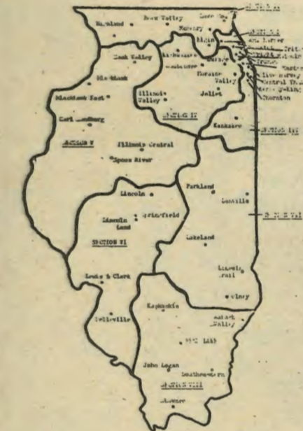
REGION IV, which encompasses the entire state of Illinois and is made up of eight sections, hosts the Regional Tourney and sends a representative school to the great Lakes District tournament in late May.

The class probably will meet two days per week, with those days determined by student demand.