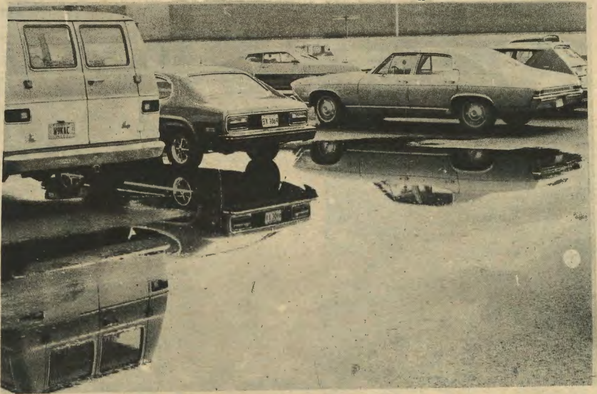
Our New Flood-Proof Parking Lots?