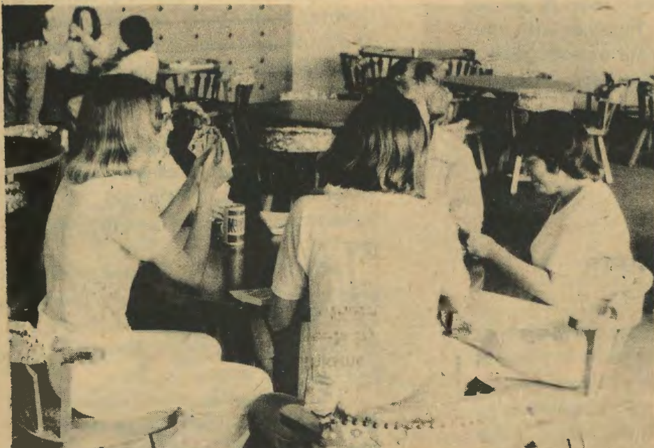
The new year looks like the old year as students sharpen their card skills in the Oasis.