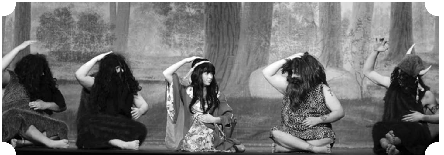
Snow White and the Five Cavemen are just one twist on traditional children's stories in Rend Lake College Theatre's "Flummoxed Fairy Tales." The annual play for local elementary school students will be at RLC on May 1 and 2 this year.

The troupe will be performing "Flummoxed" this year at 10 a.m. Thursday, May 1, and 1 p.m. Friday, May 2, in the theater. It has become such a hit with the area schools that three of the four performances are already full! Seats are currently still available for the afternoon show on May 1,