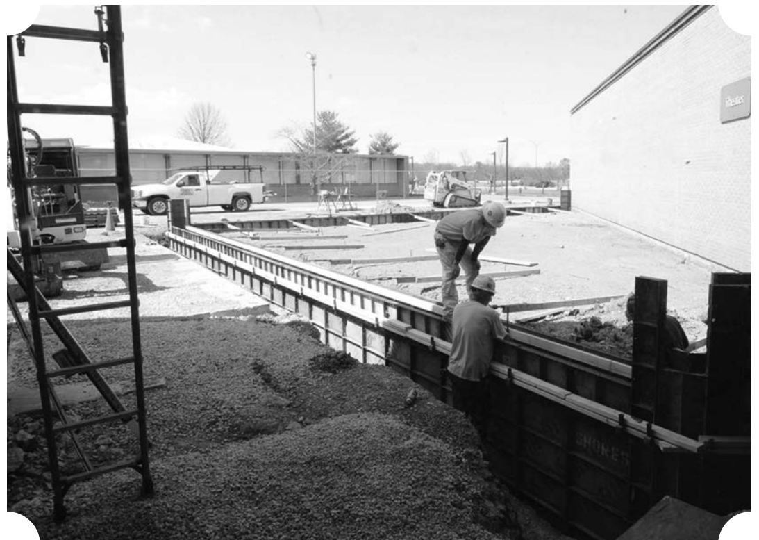
WALL ART — Workers with Shores Construction wall up what will be more than 2,000 additional square feet for art students in Fall '14.

The current ceramics and sculpture room is really the scene shop for the theater. For the past several years, we have been forced to perform most of the construction of sets on the stage, leading to issues with dirt and dust getting into the auditorium of the theater, the lighting system, and other sensitive equipment like the Steinway Grand Piano. This addition will allow us to relocate ceramics and sculpture to an art space." The project is being funded by the Capital Development Board, in conjunction with RLC.