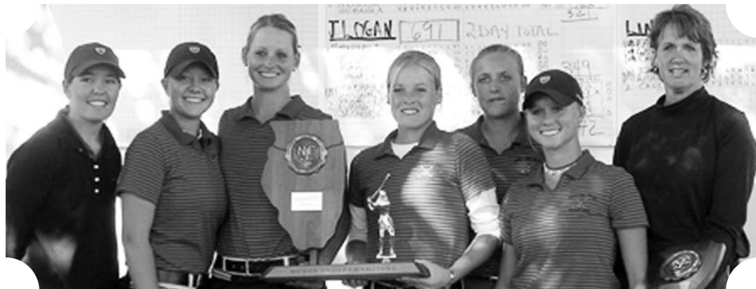
Region XXIV winners, RLC 2004-05

That spring, the determined Midwestern contenders moved up a notch to No. 4 in the nation thanks in part to a 315-shot second round which equaled the day's best by frontrunner, host and eventual champion Daytona Beach (FL) Community College. Risseeuw