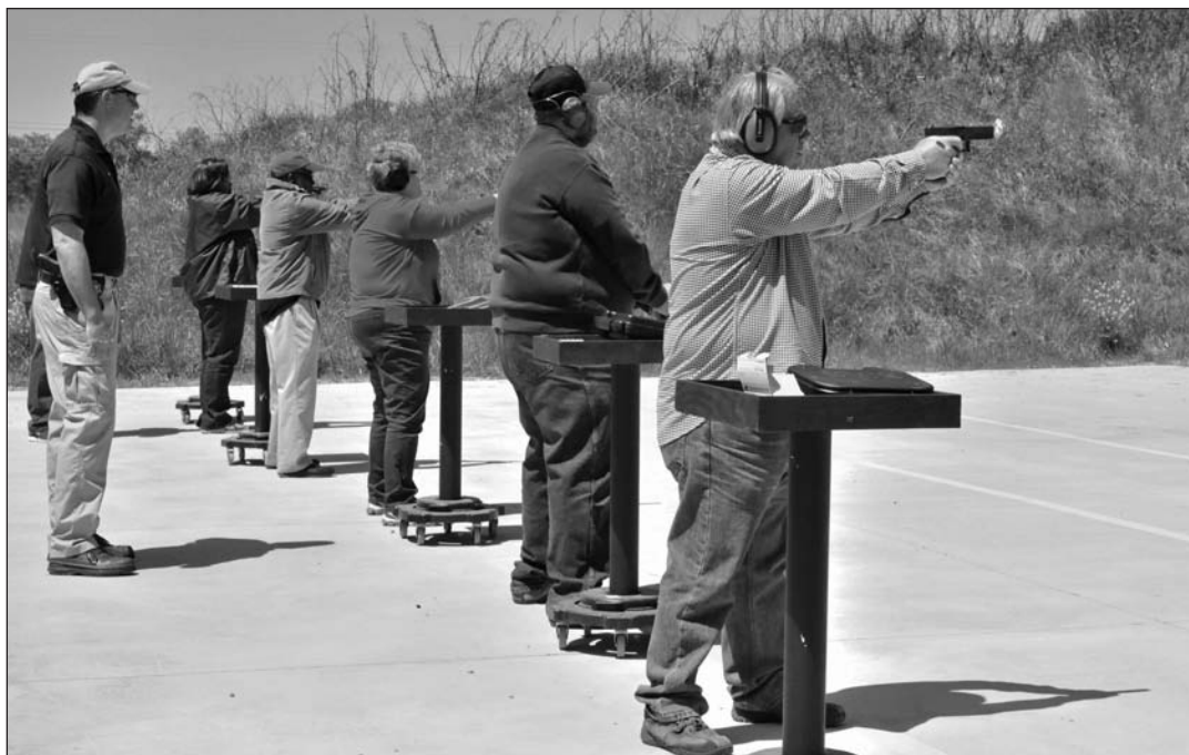
Members of the community qualify at Rend Lake College, live fire range on the Ina campus.

Pick a weekend to complete your training and call 618-437-5321, Ext. 1714 or 1380.