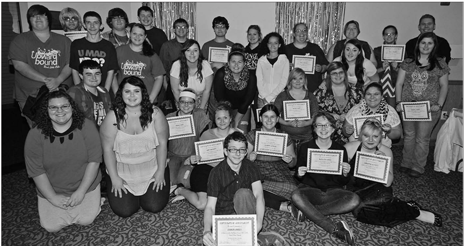
Pictured are the participants in RLC's Upward Bound programs.