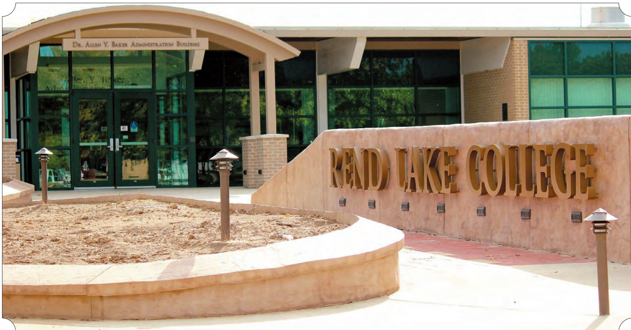
FINAL STAGE — With backlit letters recently installed, the Pathway to Success project on the Ina campus looks to be nearing completion. The project, spearheaded by the Rend Lake College Foundation, not only renovated the walkway and facade of the Allen Y. Baker Administration Building, but is raising a significant amount for scholarships.